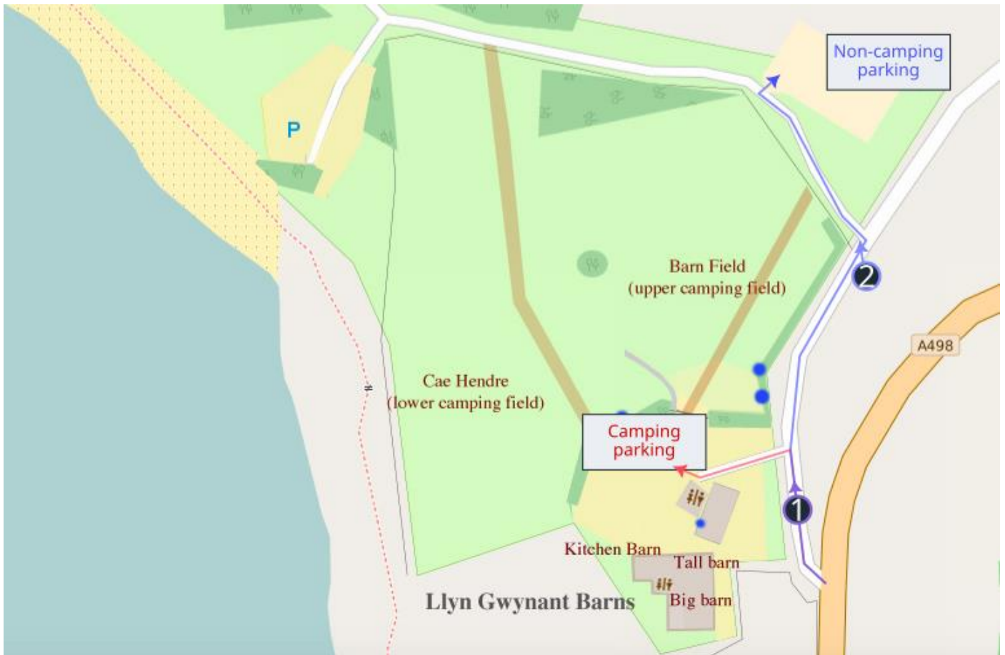
View from point 1:

After you turn off the A498, the wedding venue & camping is the first turn on your left. It has limited parking so we would ask anyone who is not camping for the wedding to use the larger overflow carpark (if possible). This is further down the road which bends to the right, then the next left through the entrance to the main campsite, and the overflow carpark is immediately on the right. If you get to the main campsite you've gone too far: